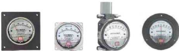
Flush, Surface or Pipe Mounted

A single case size is used for most models of Magnehelic® gages. They can be flush or surface mounted with standard hardware supplied. Although calibrated for vertical position, many ranges above 1" may be used at any angle by simply re-zeroing. However, for maximum accuracy, they must be calibrated in the same position in which they are used. These characteristics make Magnehelic® gages ideal for both stationary and portable applications. A 4-9/16" hole is required for flush panel mounting. Complete mounting and connection fittings, plus instructions, are furnished with each instrument. See page 7 for more information on mounting accessories.